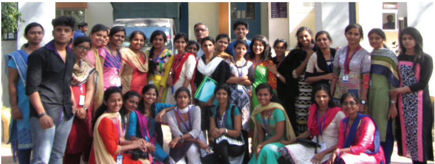
Industrial Visit to Micro labs, Bangalore by Fourth Pharm D students