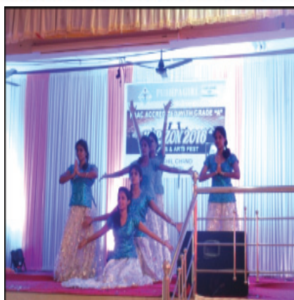
Arts & Sports Fest 2016