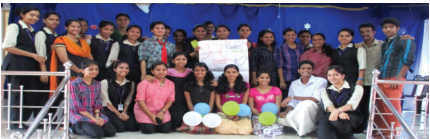
NSS Swachh Bharath event organized by III Pharm D students