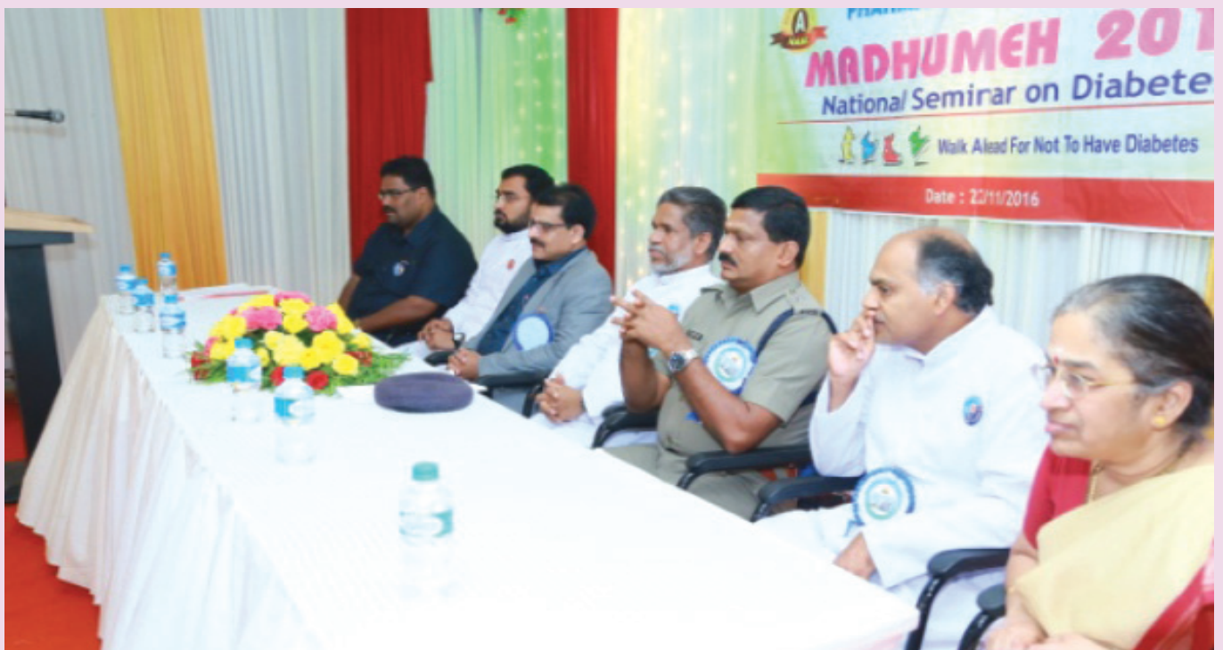
Guests & Speakers in the inaugural session of Madhumeh '16