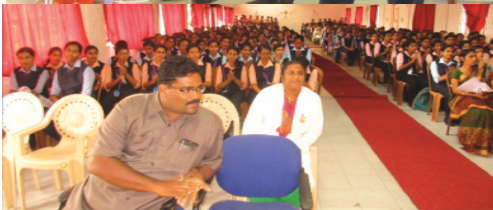
Cultural events by Final B. Pharm students during vigilance awareness programme