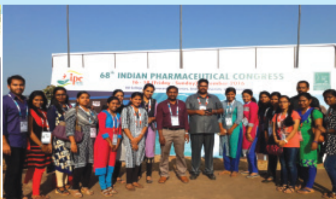
68 th IPC -2016 at Andhra University, Vishakapatnam