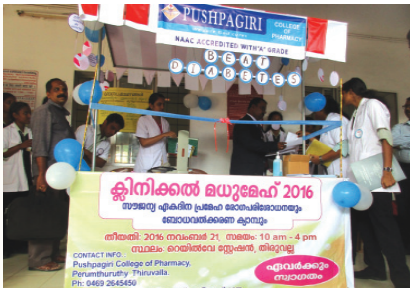
Medical Camp-Clinical Madhumeh- at Thiruvalla railway station