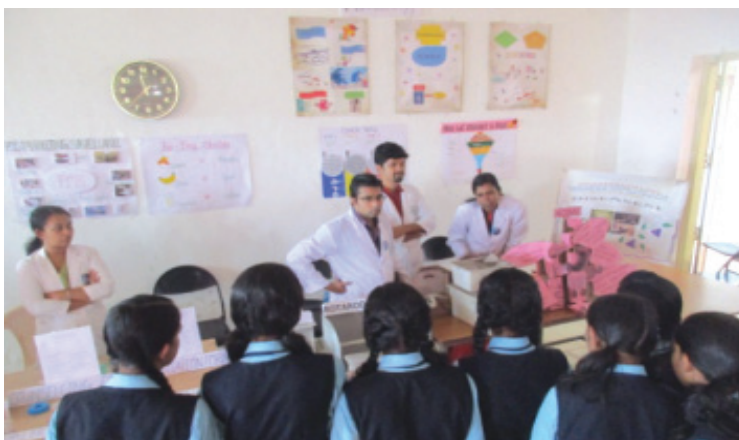
Scientific exhibition during Pharma Inspire 2016