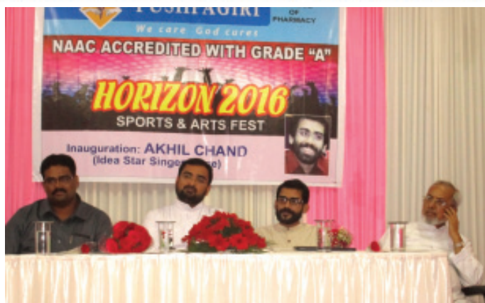
Inaugural function of Horizon 2016