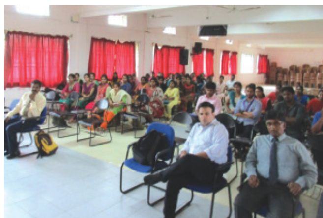
Introductory session during campus recruitment by GSK