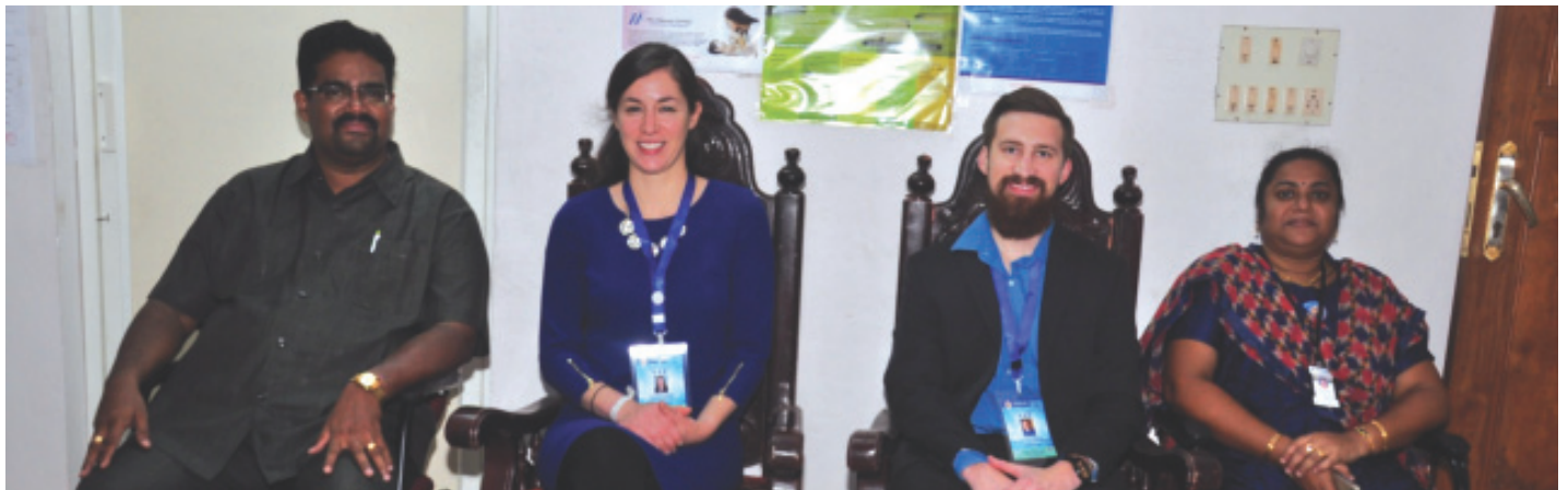
Our Professors with foreign speakers.....