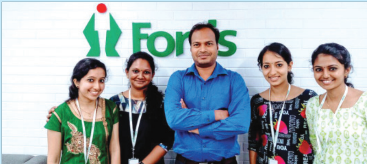
Our Pharm D interns at FORTIS Hospital, Bangalore.....

Our first batch of Pharm D interns have selected for doing their internship programme in sixth year at various multi-speciality hospitals viz. FORTIS HOSPITAL, BANGALORE, FORTIS HOSPITAL, NEW DELHI and JAYPEE HOSPITAL, NEW DELHI.