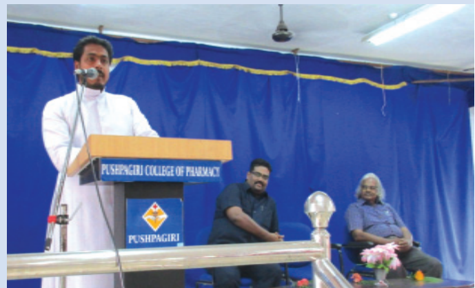
Inauguration of Basic Life Support (BLS)

The class included theory and practical sessions. Through these sessions, all the participants were able to learn the skills of high quality cardio pulmonary resuscitation (CPR) for victims of all age groups. Participants were enabled to respond quickly and confidently in any emergency situation. The session was led by five instructors. Every participant attended and passed the exams and secured certificates.