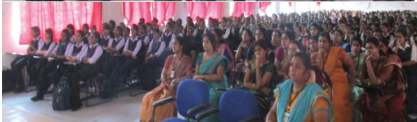
Safety of women-A Workshop Conducted by Kerala Police Women Cell