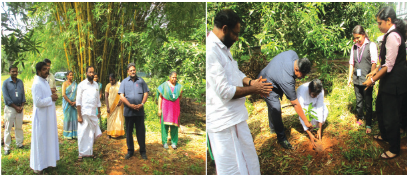
National Environment Day