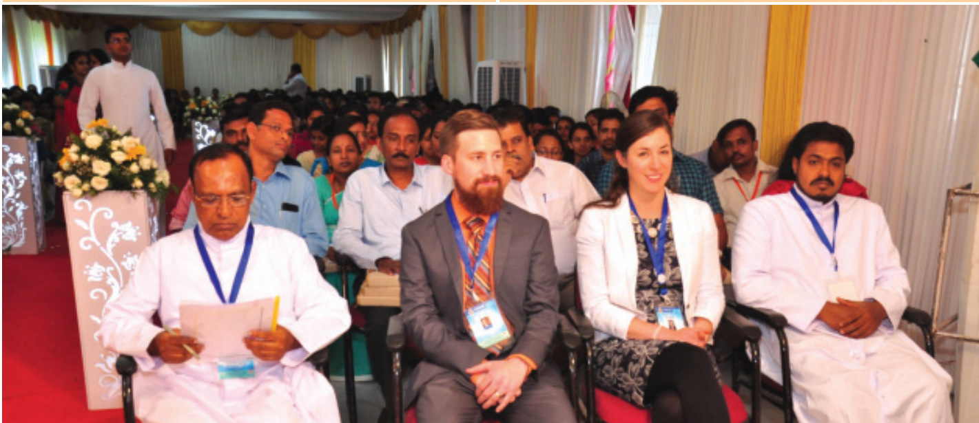
Speakers and delegates during the inaugural session of Solace 2017