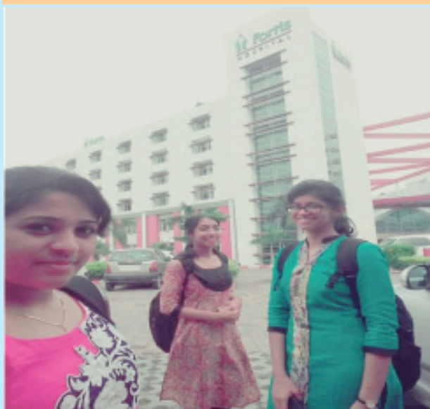
Our Pharm D interns at FORTIS Hospital, Noida.....