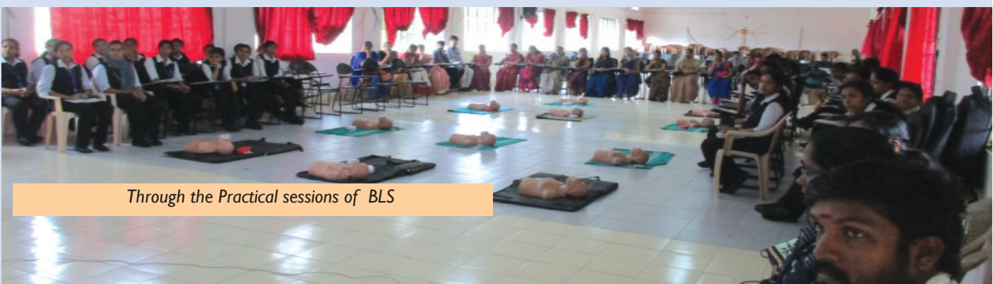
Through the Practical sessions of BLS