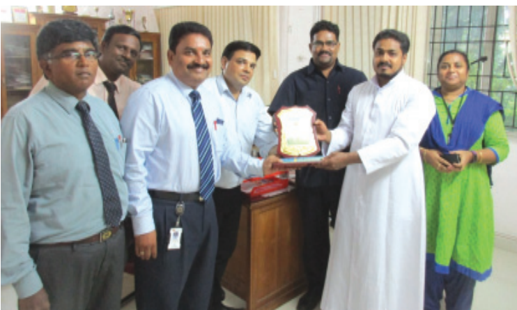
Presenting memento to GSK delegates