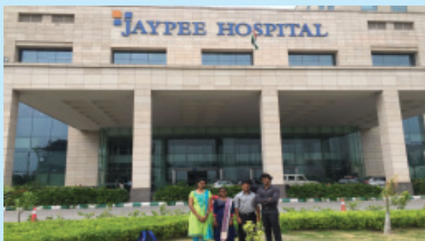
Our Pharm D interns at JAYPEE Hospital, New Delhi...