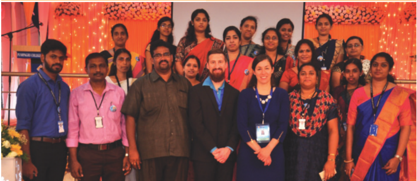
Foreign speakers from USA with teaching faculties of PCP .....