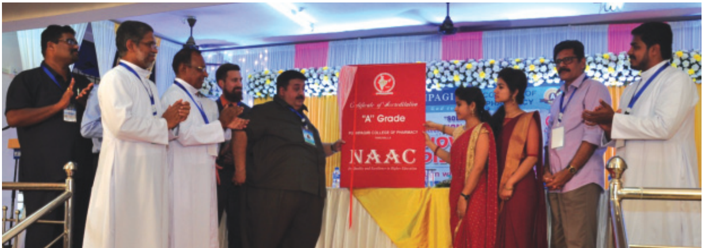
Unveiling of NAAC 'A' grade certificate during SOLACE 2016