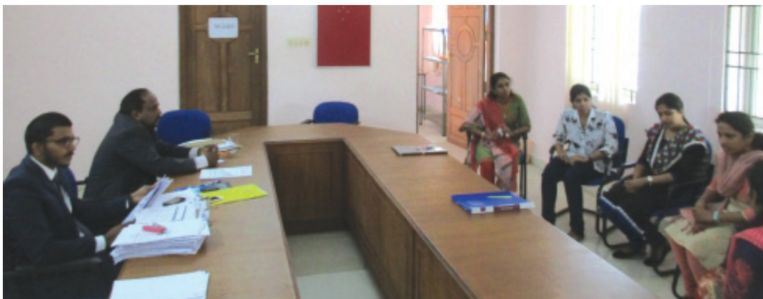
Group discussion during campus recruitment by Life Pharmacy, Dubai

As a part of selection process the students had to go through three different rounds of interview prior to reaching the final stage. Out of 11 short listed candidates, 4 candidates were from Pushpagiri College of Pharmacy.