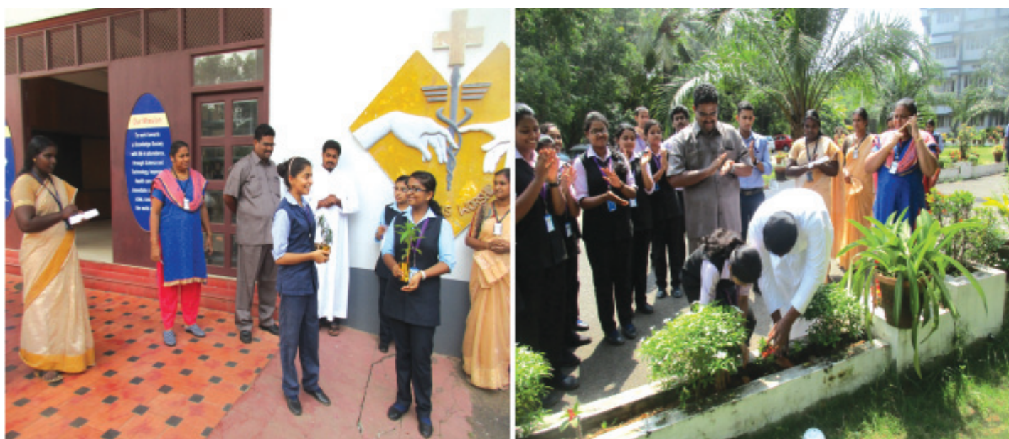
Nature Club activities