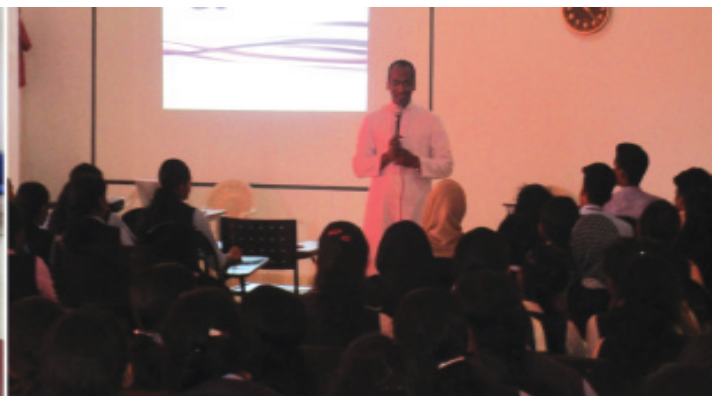
Student's orientation programme