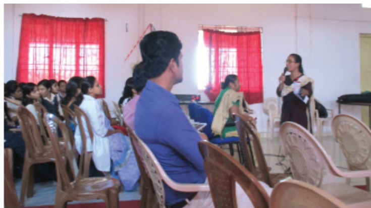
South Indian Bank Digital Awareness Programme